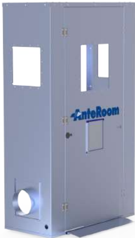
ANTEROOM 4 ft. W x 2 ft. D