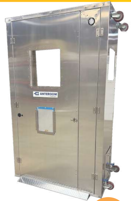
ANTEROOM 48 DD