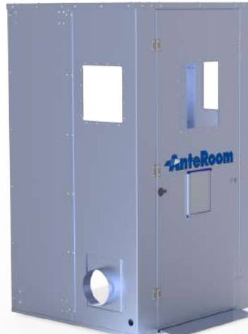
ANTEROOM 4 ft. W x 4 ft. D