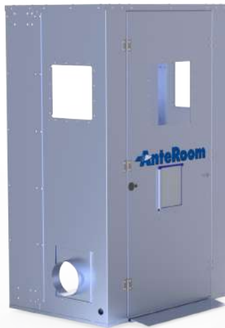
ANTEROOM 4 ft. W x 3 ft. D