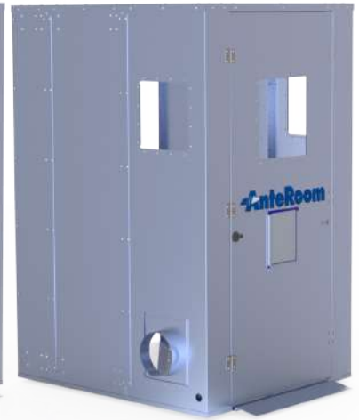
ANTEROOM 4 ft. W x 5 ft. D