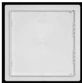
PA-3000 View of door back